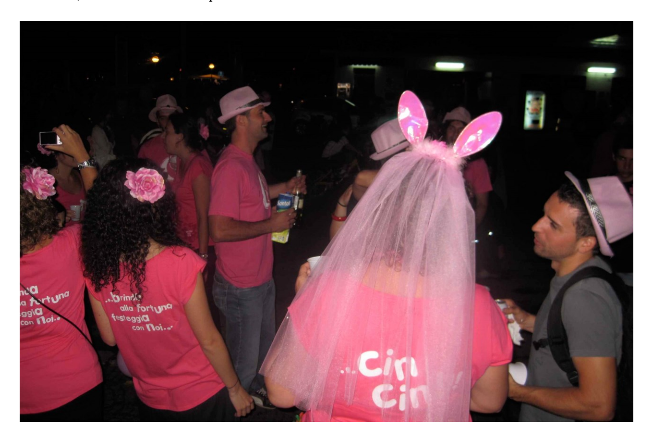
Figure 2. A fluid moment of the "sizing up game" between the males and for the attention of the Tuscan girls.

We came from Tuscany, near Pisa, just for the Pink Night... so we could celebrate her bachelorette party in kind of a special way. We also came here two years ago for the Pink Night [...] we like it because it's a way to have fun outside, in the street, instead of closed up inside.