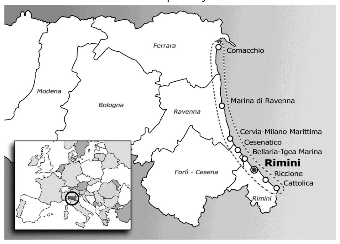
Figure 1. The Romagna Riviera, Italy.

territory belongs to four neighbor Provinces: Ferrara, Ravenna, Forlì-Cesena and Rimini, extending from Comacchio to Cattolica in the south (see Figure 1). The region is situated on the east coast of the Italian peninsula and overlooks the Adriatic Sea. It began to gain international recognition at the end of the 18^{th} century when European kings and aristocrats chose it as their sunbathing resort. Rimini – the Riviera's epicenter and now a city with 150,000 inhabitants – was nicknamed "The Ostend of Italy." The number of hotels in Rimini increased significantly in the period between the two World Wars, attracting middle class tourists and giving shape to the first specialized tourism district in Italy (Battilani & Fauri, 2009). Despite the presence of a remarkable Roman and Renaissance heritage (Tiberius Bridge, Arch of Augustus and Leon Battista Alberti's Malatesta Temple), Rimini's success as a destination was based primarily on seaside tourism.