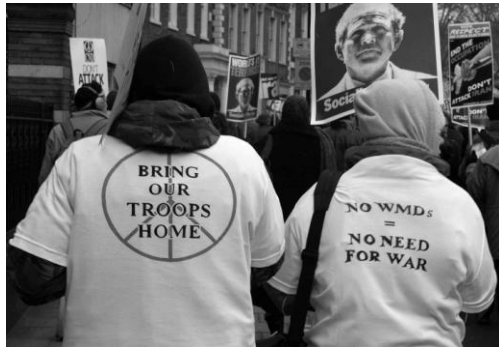
Figure 1: No WMDs = No Need for War, London, March 2006 a

a All photographs taken by Jenny Pickerill.