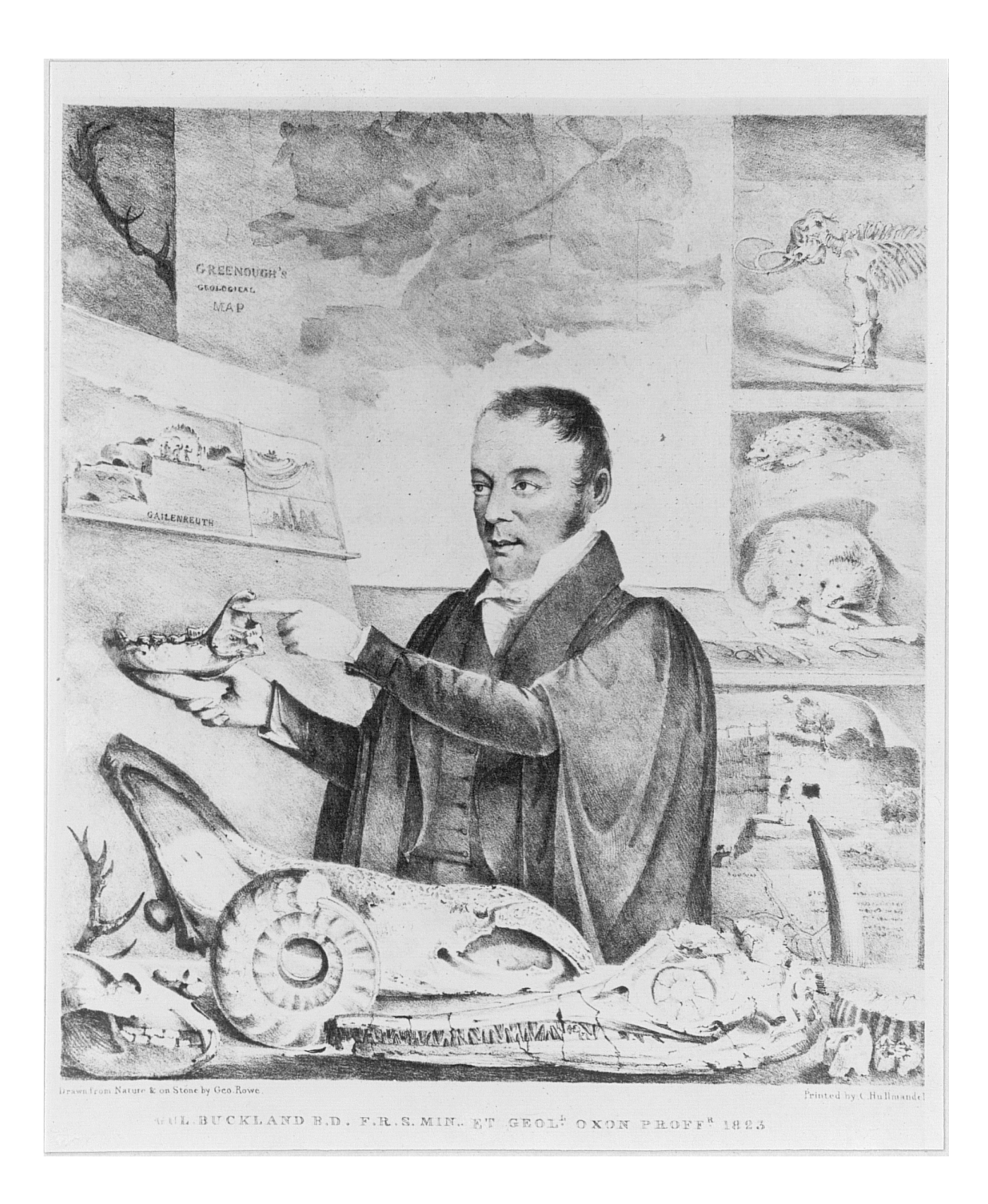
Fig. 1. William Buckland lecturing, by George Rowe, 1823.