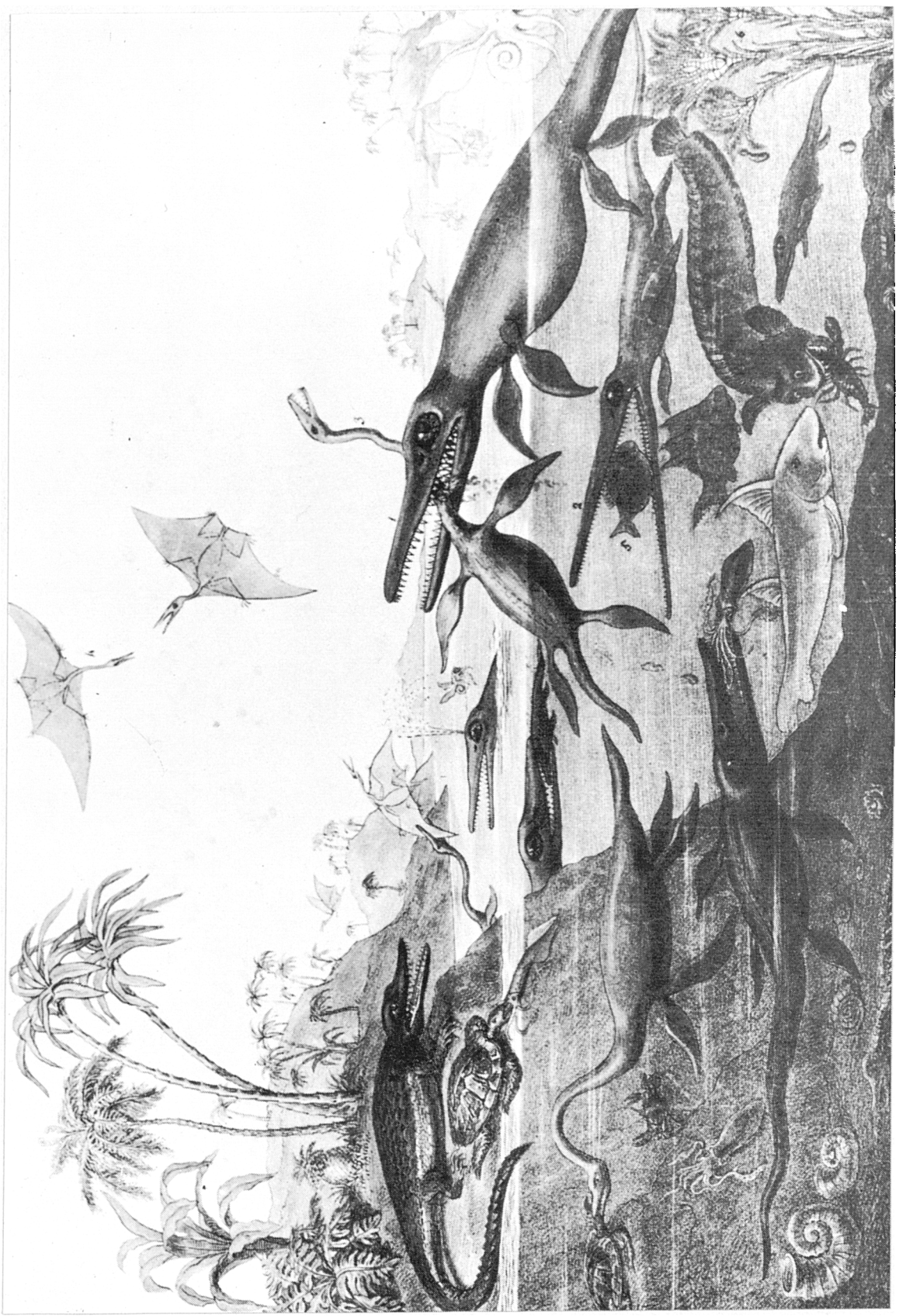
Fig. 7. "Duria Antiquor" by Henry De la Beche