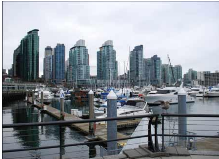
Vancouver: Coal Harbour Apartments and Marina