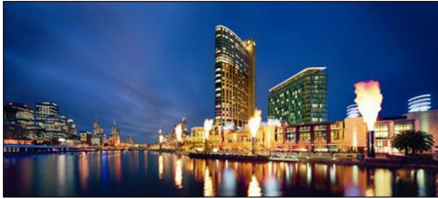
Melbourne: Crown Casino at night

One role of the state, Dovey suggests, is that of regulating the desires of its subjects. Urban waterfronts, as objects of collective fantasy, are an important site for the fulfilment of such fantasies. City waterfronts are ambiguous spaces, typically combining the most primordial of natural substances (water) with the richly sedimented residues of human intervention (the wharfs and factories that were often among the first parts of a city's built environment). It is partly for this reason that waterfronts are famously the focus of conflicts which seek to resolve their murky status as publicly-owned civic amenities, on the one hand, and spaces of private capitalist investment on the other.