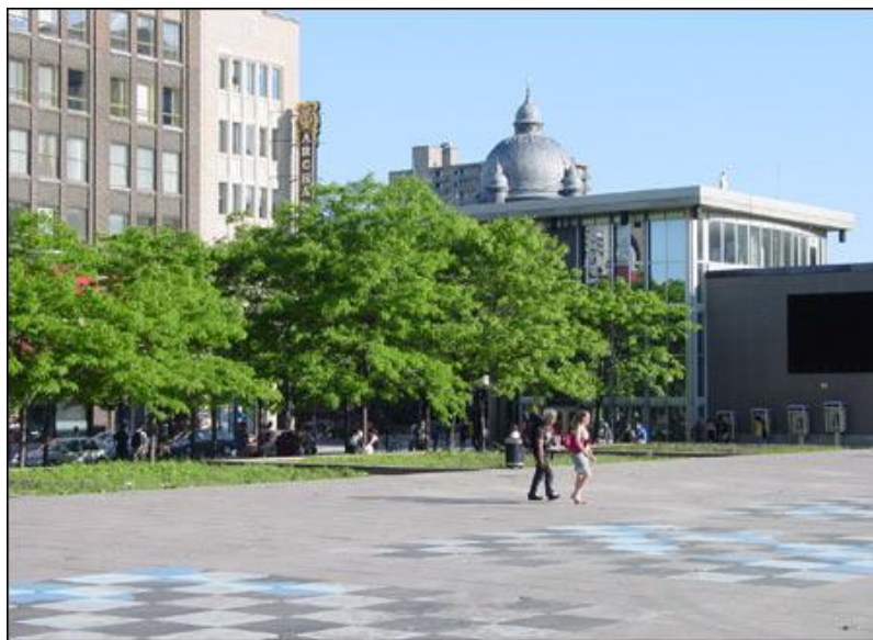
Montreal: Place Emilie Gamelin

As Campbell and Ward remind us, currency differentials, differences of language and the need for local expertise in marketing global brands require the 'regionalisation' of Google and eBay if these firms are to be genuinely international in scope and success. It will be of some interest to observe how these companies deal with the current worldwide credit crisis. As a new high-tech capital, Dublin lives out the tension between Manuel Castells's 'city of flows' and the city of place-based amenities, as Saskia Sassen has theorised it. While no material goods may pass through the doors of the eBay or Google facilities, they are nevertheless complex organisations carrying out a wide variety of functions. As such, they require both an elaborate technical infrastructure and the workforce necessary to maintain that infrastructure.