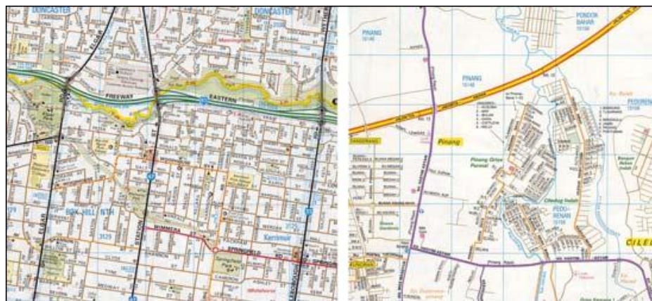
Maps of Melbourne and Jakarta Greater Melbourne Street Directory and Jabotek Street Atlas

Stephen Cairns's essay on Jakarta ('Jakarta: Cognitive Mapping the Dispersed City') begins and ends with Kevin Lynch's notion of the 'cognitive maps', through which urban inhabitants come to experience the landscapes in which they live as intelligible. Jakarta, a city in Java, has grown according to logics very different from those governing the development of western cities. Rather than expanding outwards from a core, subsuming agricultural land through suburbanisation, Jakarta has taken shape as a 'patchy fabric'. Urban forms, such as shopping centres, industrial factories and entertainment complexes, have arisen in the midst of land still used for agriculture. The result is a vast area characterised by zones of mixed activity in which the characteristics of city and village life are intertwined, as this comparison of the cartographic 'look' of areas of Jakarta and Melbourne demonstrates.