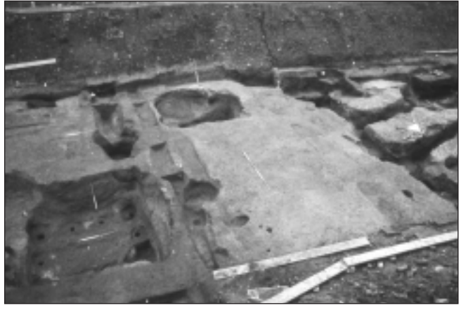
Fig. 2. Excavations at Little lane in the northeast quarter, 1988.

Looking south down north-south street separating insulae XXIV and XXV, with second-century timber cellar on left, and robbed foundations of strip buildings on right.