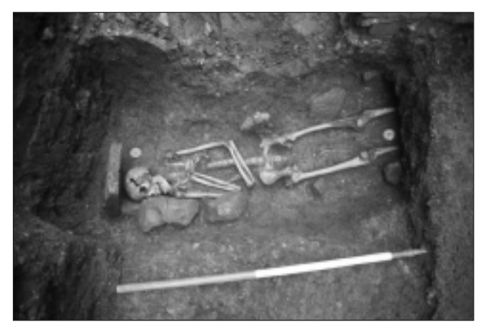
Fig.6. Excavations at Newarke Street cemetery, 1996. Detail of fourth-century grave with discontinuous grave lining (Courtesy Leicestershire County Museums Service).

(Crank 2002). On the Clarence Street site evidence for at least 31 coffins was recorded, whilst on the north side of Newarke St, discontinuous grave linings were recorded, with grave finds confined to two occurrences of bone hairpins (Michael Derrick pers. comm. ).