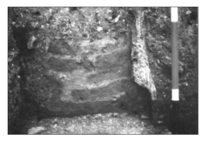
Fig 4. Excavations at Blue Boar lane 1958. Section through north wall of courtyard showing detail of clay brick structure with plaster facing, right ( Wacher site archive , University of Leicester ).

regarding the decline of this form of housing in the late Roman period (Faulkner 2000, 37, Fig. 2.11) as discussed further, below. The survival of the Blue Boar Lane town house is a therefore particularly fortuitous example of preservation due to the construction of a major public building over it, and thus sealing it from the ravages of post-Roman activity. A similar scenario protected clay brick walling at the extra-mural villa site at Norfolk Street where the wall collapsed into a cellar (Lucas 1980-81b, 103).