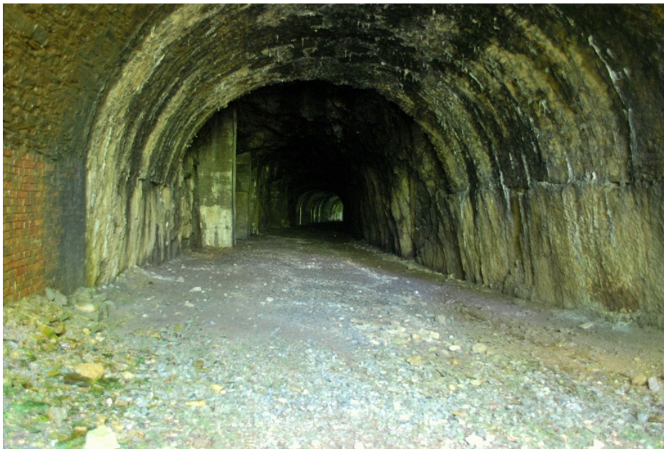
13 Kilpatrick tunnel, looking west (August 2011)

No sooner does the embankment vanish into the steep wooded hill than we are in a deep rock cutting, with the portal of the tunnel in view. Old photos show the hill was once covered in flowering gorse, but now a forest reigns supreme, and every so often trees make the perilous mistake of setting up root too close to the edge of the cutting. Once they are high enough to be caught by a strong gale, they fall in, blocking the cutting on both sides like crossed swords. The west portal is now more than half blocked with old trees, making the edifice look like some kind of lost Aztec ruin. The tunnel is dry and the floor of railway ballast remains untouched. It is 110yds long, and curves gently to the north as it works its way through Kilpatrick hill. At the far end the pattern of rock cutting and forest is repeated, until just as quickly as before the track is on a high embankment which becomes a wide stone-arch bridge over the Brinny river. On the Bandon side it is easy to be distracted by the noise of the busy N71 road nearby; on the Brinny side there is silence, except for the wind in the old trees, the river below, and perhaps some cattle in the lush fields at the base of the valley. Ahead are the aforementioned rock cuttings; beyond them the magic is diminished. What makes Kilpatrick unique in west Cork is the combination of bridge, tunnel, bridge, and cutting – a trio of topography, nature, and engineering, all in a picturesque rural setting.