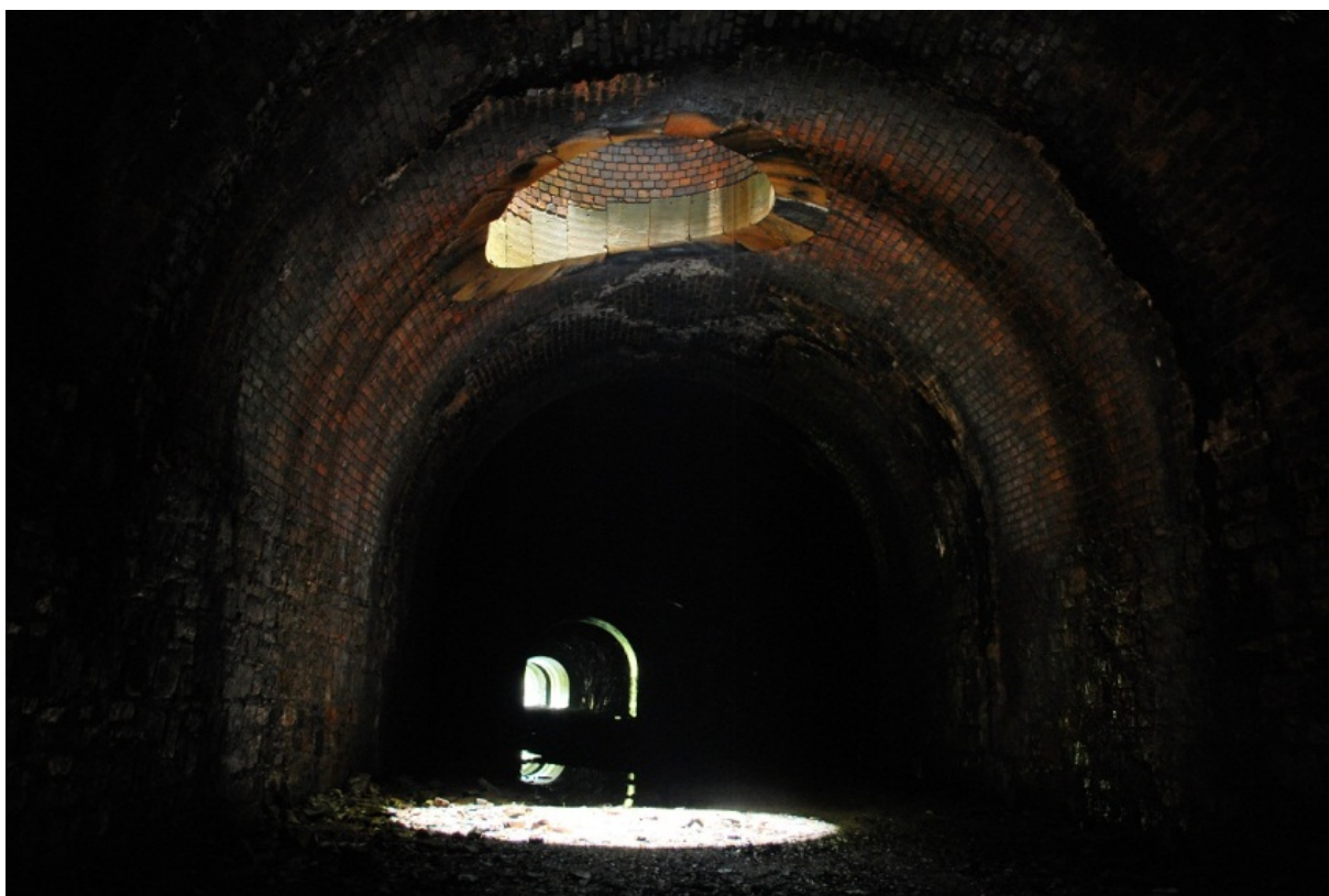
5 Ballinhassig tunnel, looking north