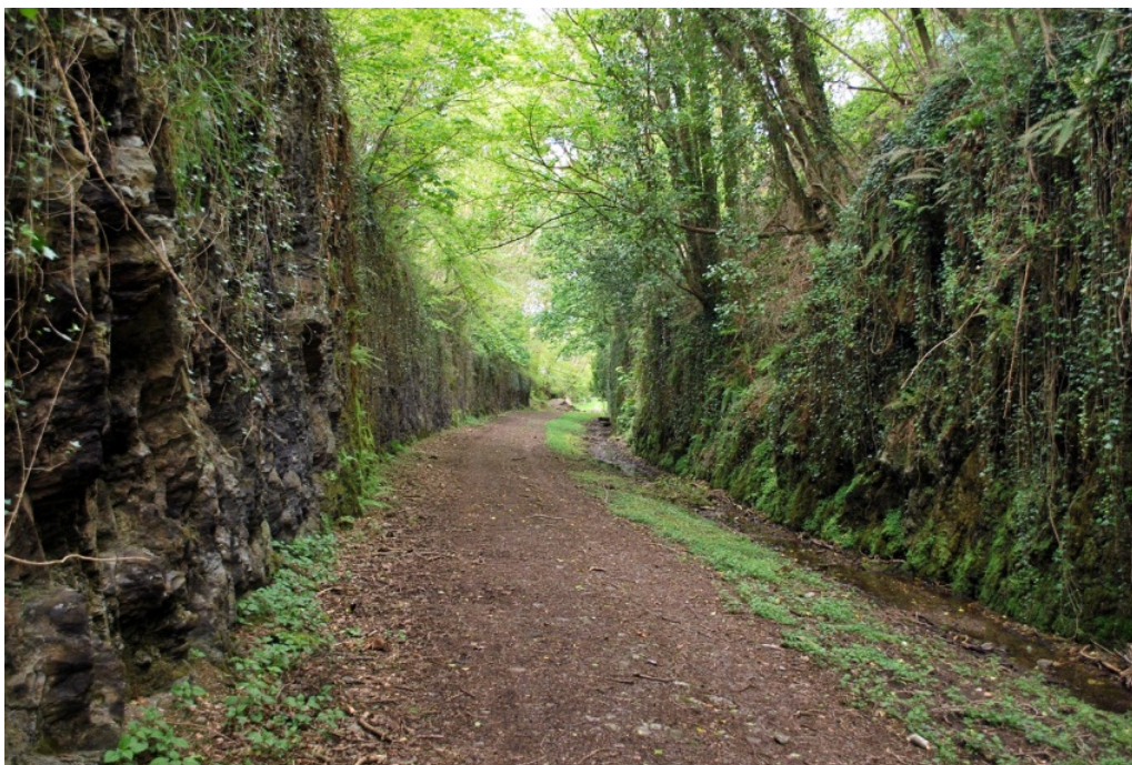
7 Brinny rock cutting no. 1 (north) (May 2012)