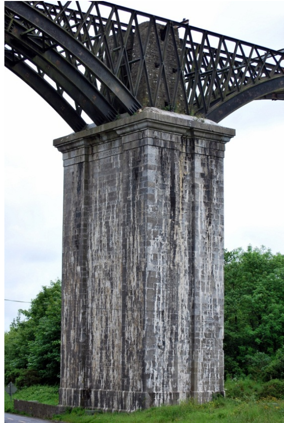
2 Chetwynd viaduct (June 2012)

It was no different for Leahy's successors in the small independent railway companies which later built the extensions to Kinsale, Courtmacsherry, Clonakilty, Baltimore, and Bantry. In the case of Clonakilty, the principal engineering work was to bridge the Argideen; for Courtmacsherry it was to follow this river and make use of its falling gradient all the way to the sea. The line to Skibbereen and Baltimore followed the valley formed by the Ilen, crossing it twice; the main challenge facing the line to Bantry was to come out of the Ilen valley and then descend rapidly to the sea, which entailed a circuitous route all the way around the town. Today it is impossible to trace the route of west Cork's abandoned railways without being at all times cognisant of the natural features presented by the landscape. In an era when one can instantly ascertain one's exact location with a GPS phone or sat-nav., it is becoming more and more unusual to have the skills necessary to visualise the landscape and to be guided by its natural features. The extra constraints attached to a railway – gradient and curvature – help to focus one's attention even more on the subtleties of the land.