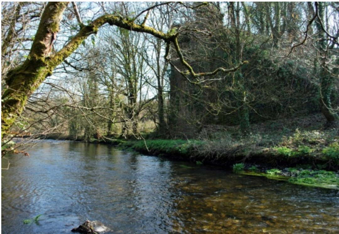
10 Argideen viaduct, south abutment (March 2011)