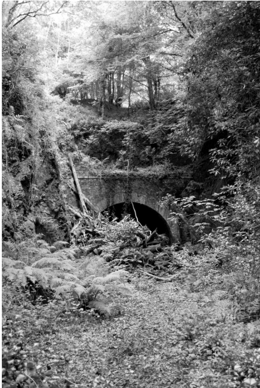
12 Kilpatrick tunnel, west portal (August 2011)

All of these sites offer their own rewards to the curious visitor. The glory of the entire system, however, is the mile of track around the Kilpatrick tunnel. I have discovered that the best time to visit is in the early afternoon on a clear winter's day, when the bare trees expose as much as possible of the remaining structures. As previously noted, the task facing the Cork & Bandon's engineer was, from the Bandon side, to bring the railway out of the Bandon valley and onto the flat plateau of the Owenboy river. The viaduct over the Bandon, known as Inishannon viaduct, was a metal lattice structure of two spans. These are now gone, as is the central pier, but both abutments survive. One does not get a sense of their scale unless looking up from below at the courses of ashlar stonework, now covered with the long fingers of ivy. Both abutments are rusticated like the best neo-classical prison or fort, a motif often used by architects to convey a sense of strength and impregnability. It is not known if the central pier was taken down, or simply undermined in some great flood, but its remains lie scattered in a heap of well-cut blocks of limestone in the centre of the river. Many birds,