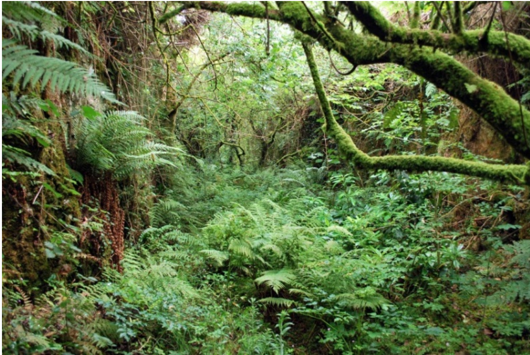
8 Rock cutting, Keilnascarta, near Bantry (July 2011)

During 2010-12 I was fortunate to have the time to conduct an archaeological survey of the entire Cork, Bandon & South Coast railway, with the help of countless 25-inch Ordnance Survey maps (c. 1888-1913). Part of the reason for doing this has been to see what is left after fifty years of neglect (2011 being, of course, the fiftieth anniversary of the closure). The tracks no longer remain in situ, and neither do the signal posts, or most of the telegraph poles, but the engineering works are generally still intact. It has been fascinating to explore the area by foot, bicycle, canoe, and car, and see how the remaining fragments of such an intricate system have fallen into decay. As the land of the permanent way was sold back to local landowners soon after 1961, the majority of the railway infrastructure was simply handed back to nature. In fifty years' time there will be even less than there is now, and one day there may even be nothing left whatsoever. The 'soft days' of mild, misty weather contribute to the jungle-like feeling of many of the overgrown rock cuttings, particularly in the western districts, with their host of straggly sally trees, ferns, gorse, ivy, moss, and insects. We could apply E.M. Forster's remark on tropical climates (in A Passage to India ) without any incongruity, when he wrote that 'the inarticulate world is closer at hand and readier to resume control as soon as men are tired.'