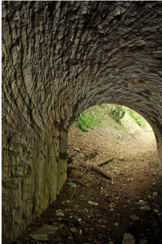
4 Curranure farm road underbridge, near Bandon (May 2012)

The route was, of course, never built. It was turned down not for the impossibility of its engineering but for the lack of political will to fund the project from the public purse. Somewhat less gigantic, though arguably formidable in places, was the route as built between Cork and Bandon. It opened in stages: Bandon to Ballinhassig in 1849, and Ballinhassig to Cork in 1851. While not wishing to overly romanticise the efforts of Leahy, the engineer Charles Nixon and others, their achievements were awesome: the Illustrated London News remarked that ‘few railways have had such a hard struggle for existence as this Bandon line’. One of the largest engineering works was the 906yd tunnel at Ballinhassig. We know from old company records that 300 men were employed at the site around 1850-51, working day and night. Six shafts were dug, allowing work to proceed at a total of 14 different faces. But we do not know the names of any of these men, nor where exactly they came from. A whole village of huts must have been built to house them and we can imagine that a local industry developed, providing sustenance, repairing clothing and tending to injuries sustained in the dark, damp, and dangerous excavation sites. Perhaps we simply cannot understand the sheer brutality of their work; there is hardly any activity we could engage in today which would give us a comparable experience.