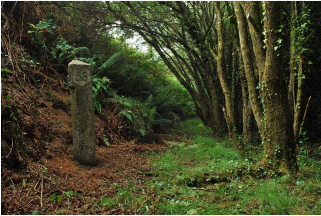
3 '56' milepost and cutting, Dromleigh North, near Bantry (September 2010)