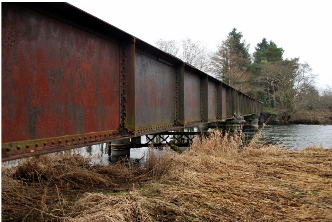
11 Milleenanannig viaduct, near Dunmanway (January 2011)

We begin with Shannonvale mill, around two miles north of Clonakilty. I visited during a dry spell in the early spring, when the land was cold and dry, the sky clear, the shadows long, and the previous summer's growth reduced to a flaxen blanket at the edges of the rolling fields. The mill, which drew its power from the nearby Argideen river, was situated around half a mile west of where the Clonakilty railway crossed the valley. Many of the mill buildings remain, most spectacularly the grain tower, with its darkened concrete and old corrugated iron. The course of the siding which served the mill, horse-powered for its entire existence, can still be seen just a stone's throw north of the old viaduct, whose piers and spans have vanished, leaving just one abutment. The eager explorer might be tempted to wade across the river, only a foot or so deep in dry weather, and climb up this abutment, a triangle of stone, at the far side, but the best view is undoubtedly from afar. A short distance away, in the oddly-named townland of Beanhill (cnoc an phonaire, hill of the beans), there is a high embankment pierced by a small road under-bridge. Though the spans are missing, the owners of a nearby house have placed some modern track over the abutments (without any supporting substructure), and relocated a nearby milepost down by the side of the local public road. The whole ensemble – track, valley, mill – is as good an essay as any in proto-industrial development in rural Ireland.