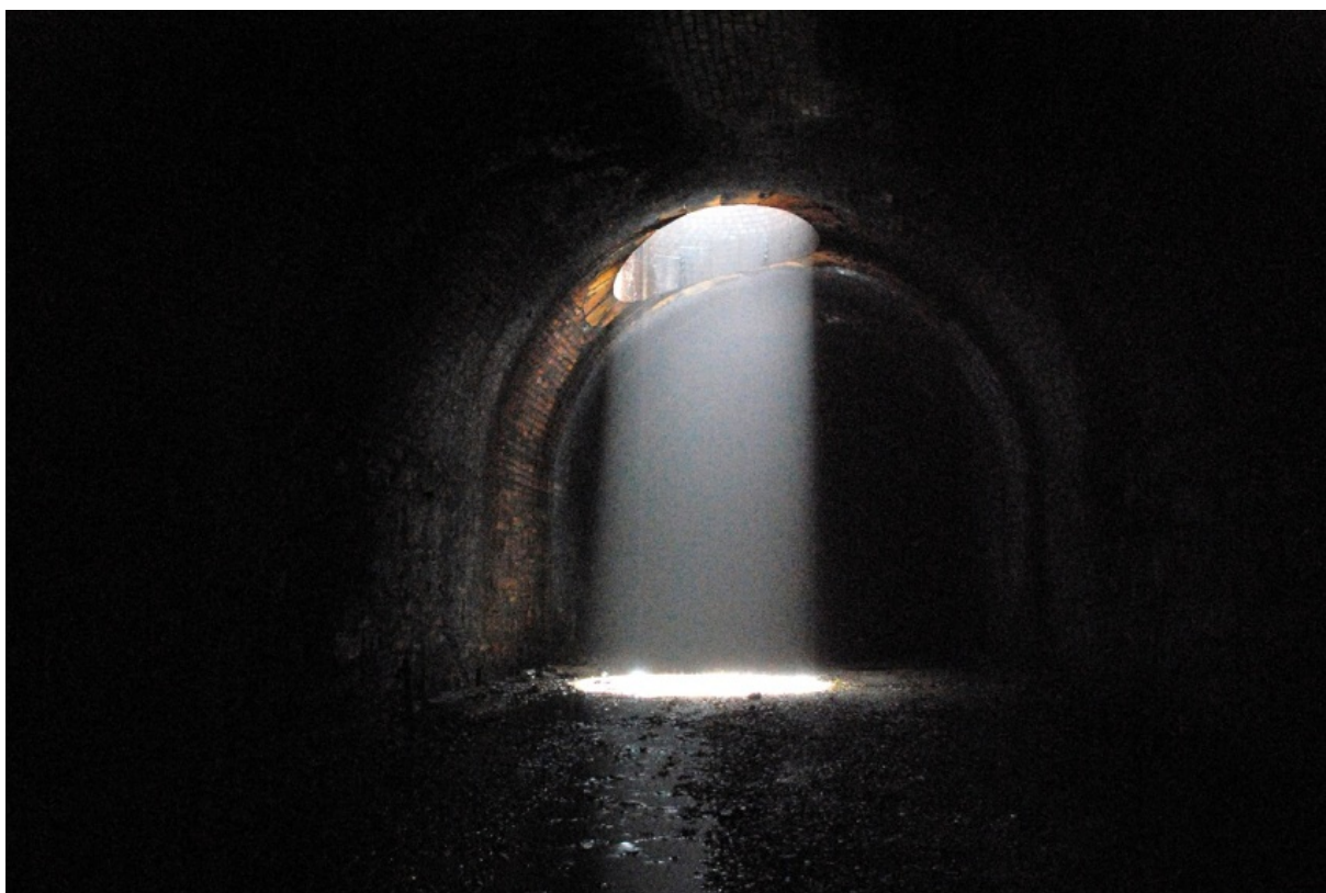
6 Ballinhassig tunnel, shaft