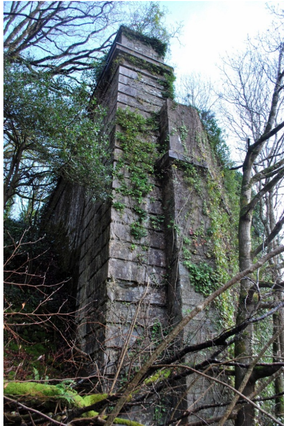
1 Inishannon viaduct, east abutment (January 2012)

It is a truism that before humans set foot in Ireland there was land, water, and nature. In a similar way, before railways were planned and built in the nineteenth century, there were hills and valleys, rivers, forests, as well as the hallmarks of centuries of human activity: roads small and large, villages, and towns, woven together by centuries-old economic and social ties. This human activity was at every stage affected by the landscape: rivers dictated settlement patterns, and mountains separated communities. In time this relationship was inverted as the landscape was in turn altered by streams diverted to power mills, forests felled and cut up, estates planned, and so on. The railways continued this process of reforming the rural landscape, and the new specifications so characteristic of the engineering of the period – gradient and curvature – necessitated bolder and more magnificent disturbances of the natural environment.