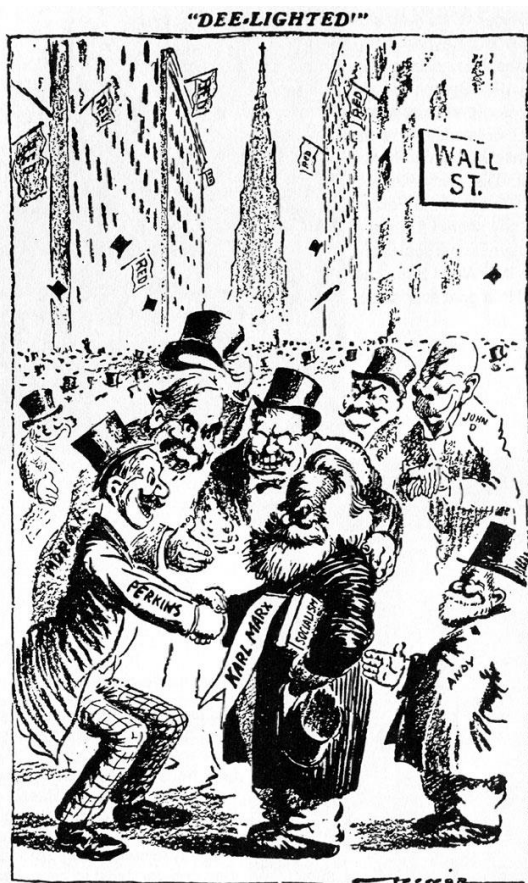
This cartoon by Robert Minor appeared in the St. Louis Post-Dispatch in 1911. 73

They also funded Trotsky after The Czar refused permission to Rockefeller for access to their light crude 72 with a $20m gift by Jacob Schiff to go back to Russia and change history. It might seem strange that the supra-rich support socialist efforts but it is not. It is big government by any measure and in big government there is no free enterprise and there is no competition. If you happen to own a cartelized industry and have influential friends who are the leaders that run the state then it will not be long before you prosper. Meanwhile you will belong to the ruling class and have time to set up your tax exempt foundations.