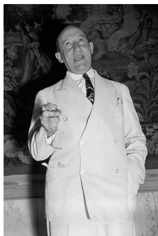
Morris Fishbein (1889-1976)

caused blindness another quietly killed people in their sleep and yet another was so poisonous that it caused the deaths of a large numbers of users. 32