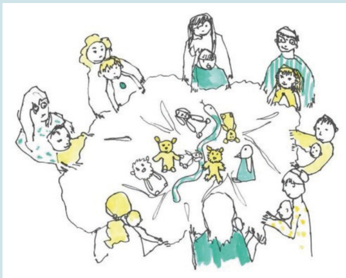
Image credit: Loud & Clear at Sage Gateshead Illustrator Ditte Elly Gourd

and their carers an object to keep and which can be used for remembering, constructing and narrating their life story (Sage Gateshead, 2013).