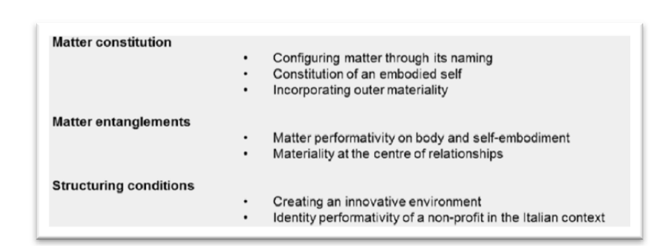
Figure 1. Performative dimensions of the innovation process in IPR

Through the analysis of interviews, observational and documentary material, three key constitutive aspects of the innovation process have been identified, as summarized in the table below.