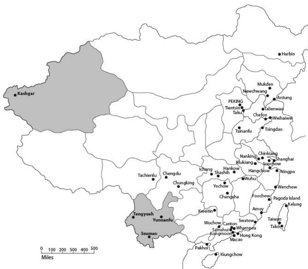
Map 3.1 Map of all consular establishments that existed during parts of the early twentieth century.