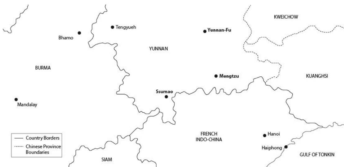
Map 3.3 Map showing the proximity of British Burma and French Indochina from Tengyueh, Ssumao, Mengtsu and Yunnan-fu (Kunming).