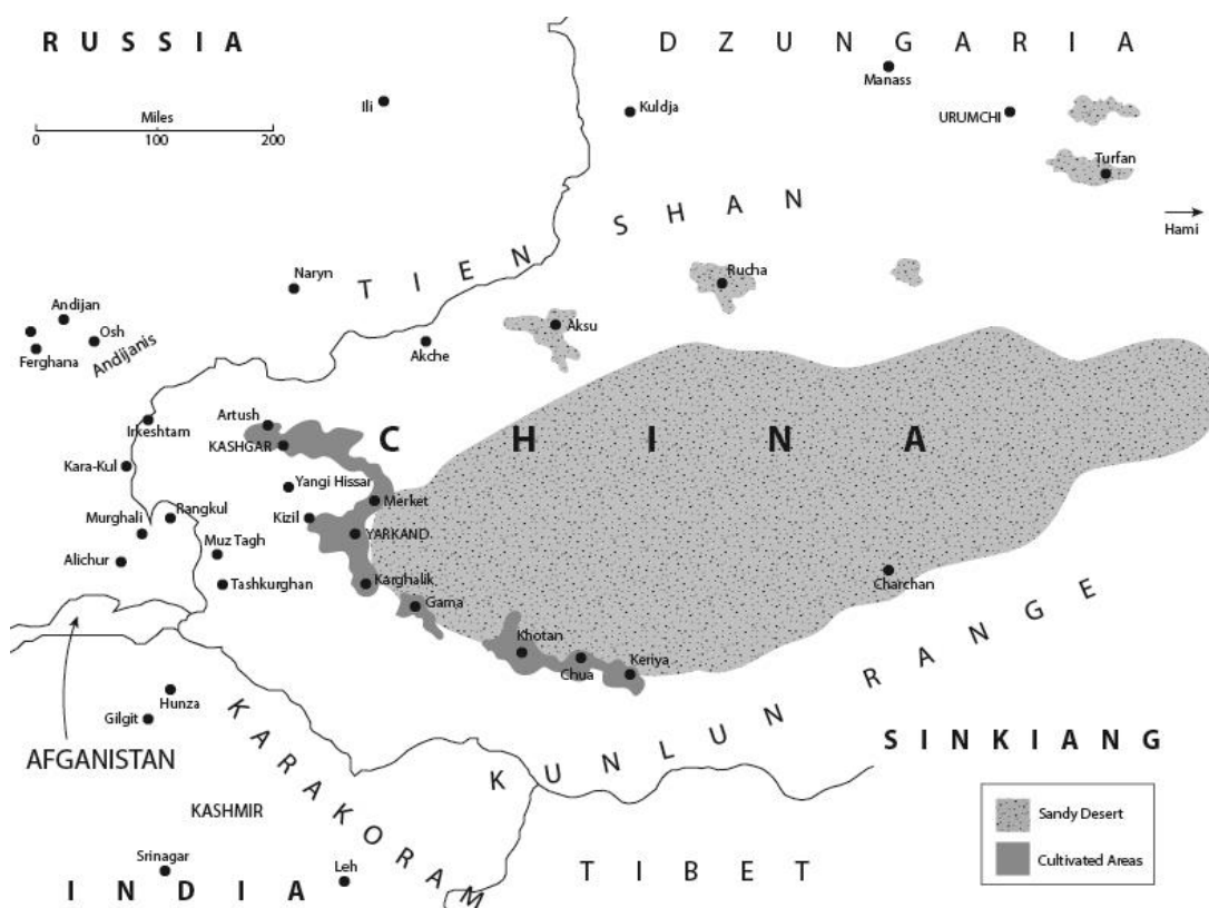
Map 3.2 map of 'Sinkiang' (Xinjiang) in the late nineteenth century