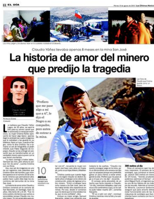
Figure 2. Emotive Expressions