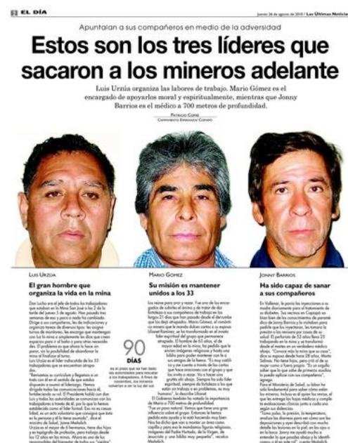
Figure 4. Secondary phase: Developing roles and personas

Apart from the use of descriptive language, profile-style statements and pictures of the chosen individuals were also featured. LUN and El País showed this content as small bibliographic-style reports of selected miners, with supporting quotes from relatives about their personality and likely emotional state. For instance, on August 26 th , LUN dedicated a whole page to a detailed account of the leading miners (Figure 4).