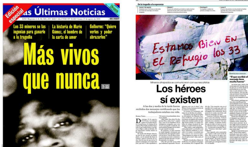
Figure 3. Constructions of Heroes: Primary Phase