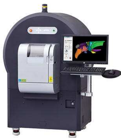
Quantum GX2 microCT

THE MORE YOU IMAGE THE MORE YOU UNDERSTAND