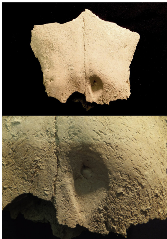
Fig. 3. Healed depression fracture to left frontal, cattle skull deposit B4 (DZSWS.1965.13. 83a), Beckhampton Road long barrow.

spheres of the functional and economic. Paleopathology is well-placed to engage with theoretical approaches that emphasize the interpretative aspect of all scientific practices.