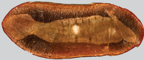
Fig. 4. The holotype of Tullimonstrum gregarium (PE 10504).

In contrast to other famous Lagerstätten, such as the Burgess Shale or Chengjiang, the flora and fauna of the Mazon Creek are largely recognizable but an extraordinary exception is Tullimonstrum gregarium (Figure 4). Discovered in 1955 by a local collector, Francis Tully, and found only in the Mazon Creek Lagerstätte, the enigmatic ‘Tully Monster’ is a popular fossil organism, recognized by the public as the State fossil of Illinois and by its use in advertising campaigns by U-Haul™.