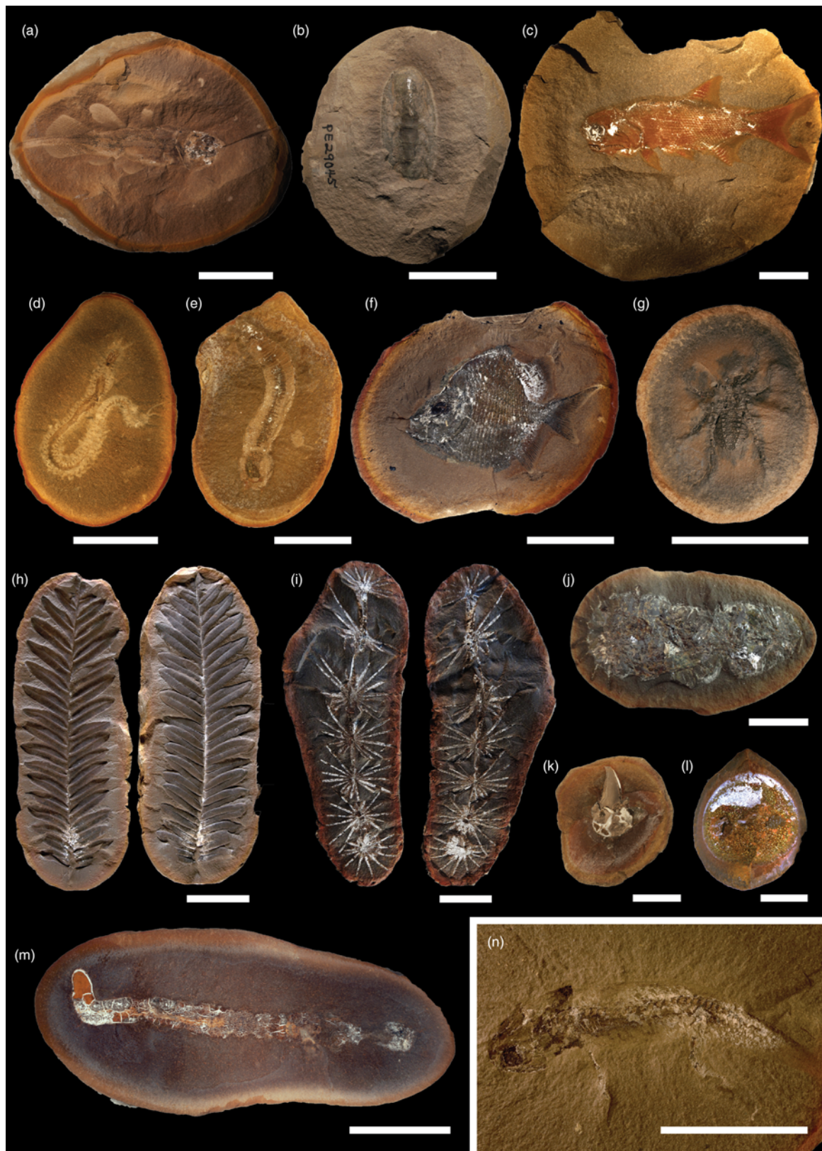
Fig. 3. A selection of fossils within siderite concretions from the Mazon Creek Lagerstätte. (a) Rhabdoderma sp. (ROM56774). (b) Chiton Glaphurochiton concinnus (PE29045). (c) Rhabdoderma ( exiguum ?) (Burpee/Lauer Foundation LF836). (d) Polychaete Esconites zelus (ROM47529). (e) Priapulid Priapulites konecniorum (FMNHPE25135). (f) Actinopterygian Platyosomus circularis (FMNHPE7333). (g) Unidentified trigonotarbid arachnid, most probably Aphantomartus pustulatus . (BMRP2014MCP850). (h) The seed fern Alethopteris sp. (ROM43584). (i) Asterophyllites sp. ROM 43576. (j) Annularia stellate (?) that has been overgrown with sphalerite (LEIUG83622). (k) Chondrichthyan tooth; Phoebodus ? (ROM56812A) demonstrates, that despite an absence of large fossils, larger animals lived in the Mazon Creek area. (l) Concretion with pyritic core from pit 11 (not accessioned). (m) Holothurian Achistrum ? (P69TG22a). (n) Saurerpeton obtusum (ROM56804B). Scales: 20 mm. Accurate locality data for fossils are often sparse, and most are often referred to by the associated strip-mine ‘pit’ number; however, some pits (such as Pit 11) are geographically wide, making this information less useful.