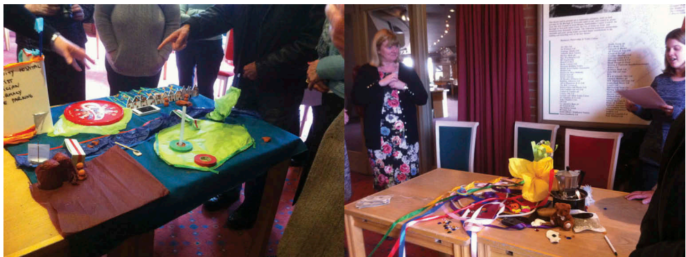
Figure 2. Different art installations representing communities that have great health.

A third type of empowerment was identified as the capacity of the participants to shape their relations and partnerships and ultimately develop their organisational capacity to act in concert with one another. This type of empowerment appeared as a relational