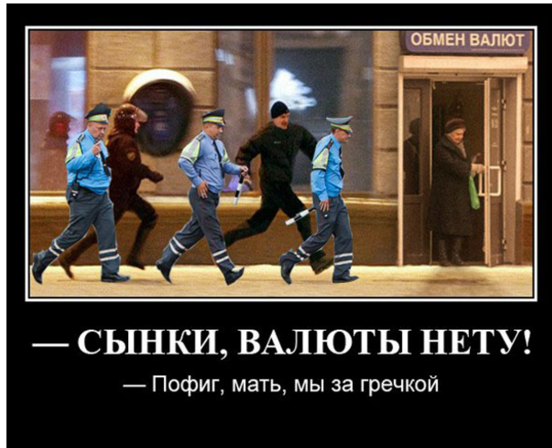
FIGURE 4 An example of the internet meme that plays on shortages of foreign currency and deficit of buckwheat in 2011 in Belarus.