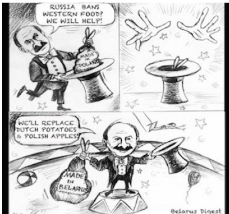
FIGURE 5 An ironical illustration of how Belarus supports Russia after Russian food embargo of certain western food.

BelarusDigest, 2014 ( http://belarusdigest.com/cartoon/cartoon-russia-bans-western-food-we-will-help-18879 )