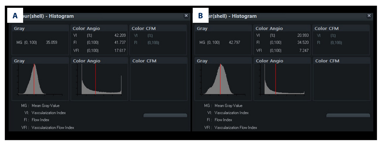
Figure 2. Histograms of the vascular indices. The vascular indices of the same monochorionic-diamniotic twin pregnancy with selective growth restriction (A smaller fetus and B larger fetus) at 30<sup>+4</sup> weeks of gestation, shown as a histogram.

between co-twins were compared by a paired t test or a nonparametric paired test. Categorical variables are expressed as absolute values with percentages and were compared by a Pearson's chi-square test. Bivariate correlation analyses were performed to determine the relationship between the co-twin utero-placental perfusion indices (as well as the discordance), GA, and the birthweight discordance. Univariate and multivariate logistic regression analyses were performed to identify the predictive parameters for sGR. Based on the logistics model, we combined the probabilities. Sensitivity and specificity were calculated by a receiver operating characteristic curve (ROC) analysis. Thirty twins were randomly selected to evaluate the intraobserver and interobserver variation in the placental vascularization data post-processing. Intraobserver variation was examined by L.Z., and interobserver variation was examined by L.Z. and X.W. All p values were two-sided, and a value of <0.05 was considered statistically significant. Statistical analyses were performed with SPSS version 21.0 (IBM Corporation, Armonk, NY, USA) and MedCalc version 11.4.2 (MedCalc Software, Ostend, Belgium).