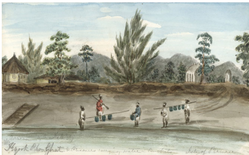
Figure 1. Arracan [Arakan] 14th February [1849] Kyook Phoo [Kyaukpyu] Ghat & Prisoners Carrying Water in Buckets, Isle of Ramree. Watercolour by Clementina Benthall. Benthall Papers, Centre of South Asian Studies, University of Cambridge.

had annexed in 1849 following its victory in the first and second Anglo-Sikh Wars of 1845–1846 and 1848–1849 (Figure 1). 52 In the aftermath of these wars, the British convicted, jailed, and transported dozens of former soldiers to mainland prisons or penal settlements in South East Asia (Figure 2), many under charges of “treason”. These military men were well trained, drilled, and experienced in handling weapons. In later years, particularly after remaining loyal to the East India Company during the Indian rebellion of 1857, the British came to favour men of this region for employment in both the Bengal army and the Indian police service. They constituted one of India’s “martial castes”, for their alleged physical superiority and military prowess. 53 During the intervening decade, however, they were certainly not preferred prisoners or transports. Defeated, demoralized, and dispossessed, Punjabi soldier convicts carried anti-imperial sentiment with them into transportation, and agitated continuously against their penal confinement, sometimes in concert with ordinary convicts.